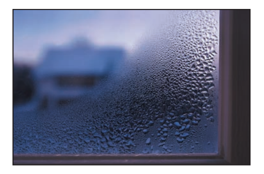
Condensation on the inside of a window-pane.

Keep indoor humidity low. If possible, keep indoor humidity below 60 percent (ideally between 30 and 50 percent) relative humidity. Relative humidity can be measured with a moisture or humidity meter, a small, inexpensive ($10-$50) instrument available at many hardware stores.