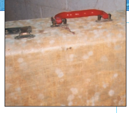
Mold growing on a suitcase stored in a humid basement.

It is important to take precautions to LIMIT YOUR EXPOSURE to mold and mold spores.