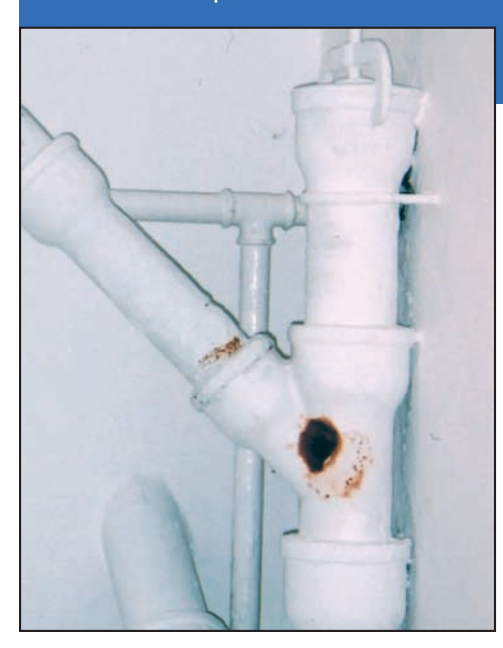
Rust is an indicator that condensation occurs on this drainpipe. The pipe should be insulated to prevent condensation.

Renters: Report all plumbing leaks and moisture problems immediately to your building owner, manager, or superintendent. In cases where persistent water problems are not addressed, you may want to contact