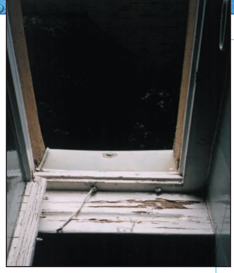
If you already have a mold problem – ACT QUICKLY. Mold damages what it grows on. The longer it grows, the more damage it can cause.