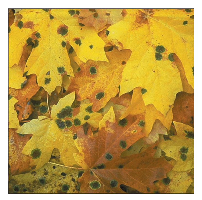
Mold growing on fallen leaves.

This document is available on the Environmental Protection Agency, Indoor Environments Division website at: www.epa.gov/mold