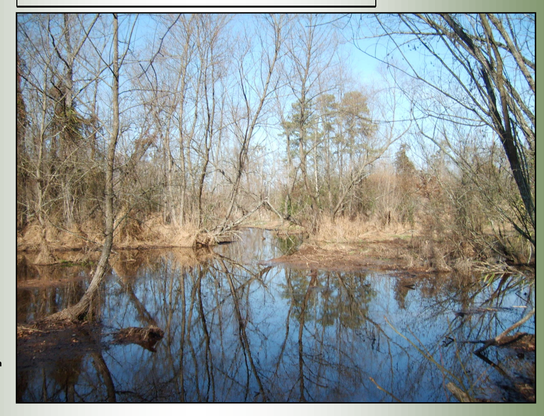
262 Acres | Devil's Pond Road | Oglethorpe County, GA | 30648